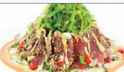
Pan-Seared Tuna w. Soba Noodle

Chicken 22 Shrimp / Steak / Salmon 23 Combo (2 items) 26