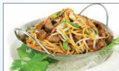
Beef Lo Mein