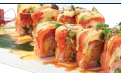
Painted Lady Roll