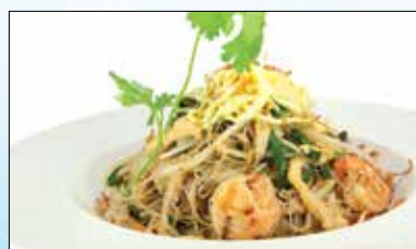
House Special Mei Fun